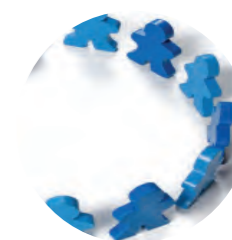
Compliance & Culture