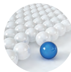
Design and Innovation

Regular repeat business from demanding blue chip clients is testament to the service we provide.